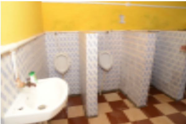
CWSN TOILET PHOTO